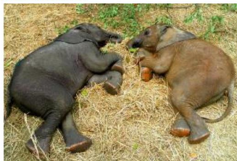
Zambezi (right) keeps a watchful eye on his new stable-mate Suni